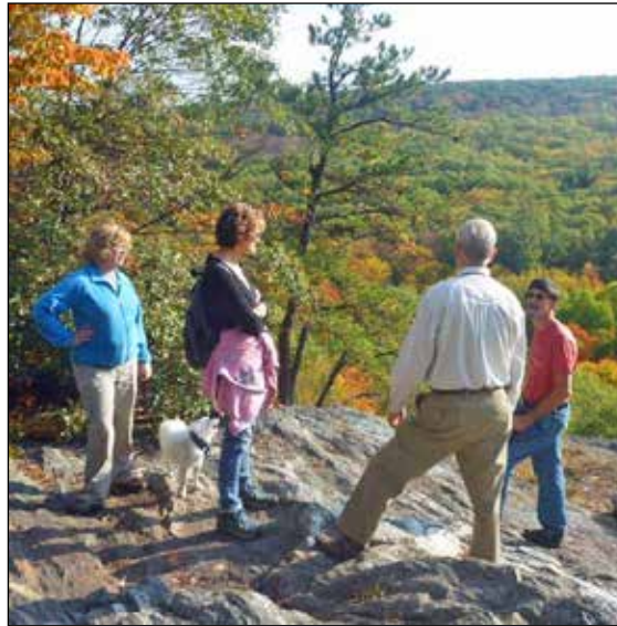
Webster Preserve overlooking Valley Falls.