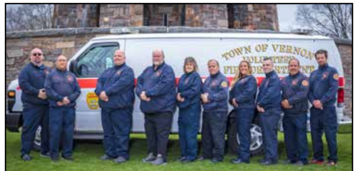
The Vernon Fire Company