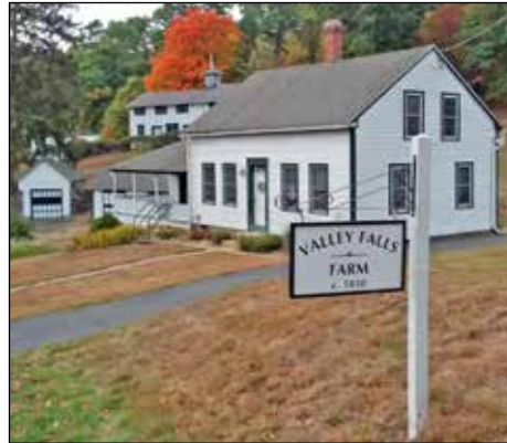
Valley Falls farmhouse.

As more residents discovered the park, its popularity grew, as did the Friends organization. In 1977 the Friends became an advisory group to Vernon's Recreation Commission and monitored park conditions. During the '80s and '90s it worked with the Parks and Recreation Department and sponsored environmental studies, organized nature walks,